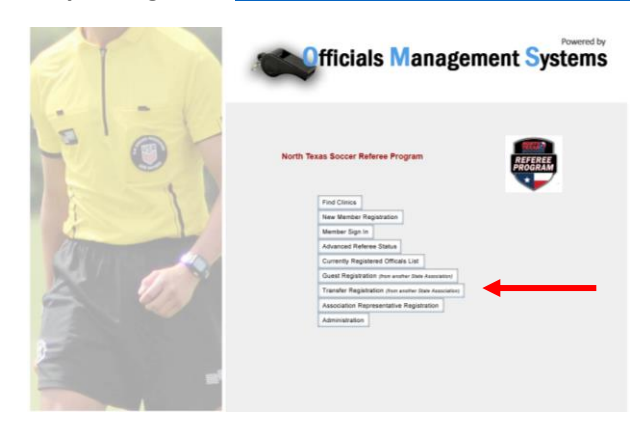
Step 4: Create an OMS profile by completing the Request a Transfer to North Texas Soccer online form.